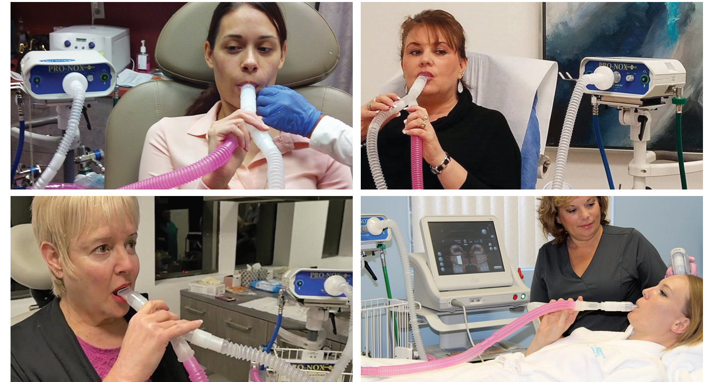
Patients using Pro-Nox in procedure rooms

The Premier Name in Nitrous Oxide Systems