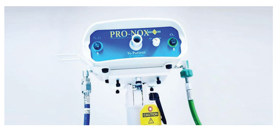
Pro-Nox Nitrous Oxide System

The CAREstream team is here to support you through continuous learning on our many webinars, training sessions and more! In addition to the outstanding support personnel, we can provide you with Articles, Studies, References and so much more. We are here to help you through the process of adding Nitrous to your pain management toolbox.