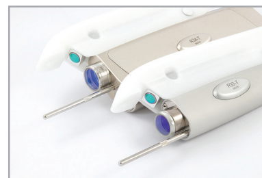
R33-T and R34-T handpieces with MatrixView™

The second stage consists of a revolutionary non-ablative Er:YAG SMOOTH® mode, ideal for skin tightening. The intense, controlled surface tissue heating stimulates collagen remodeling and initiates neocollagenesis. The effects result in an overall improvement of laxity and elasticity in the treatment areas.